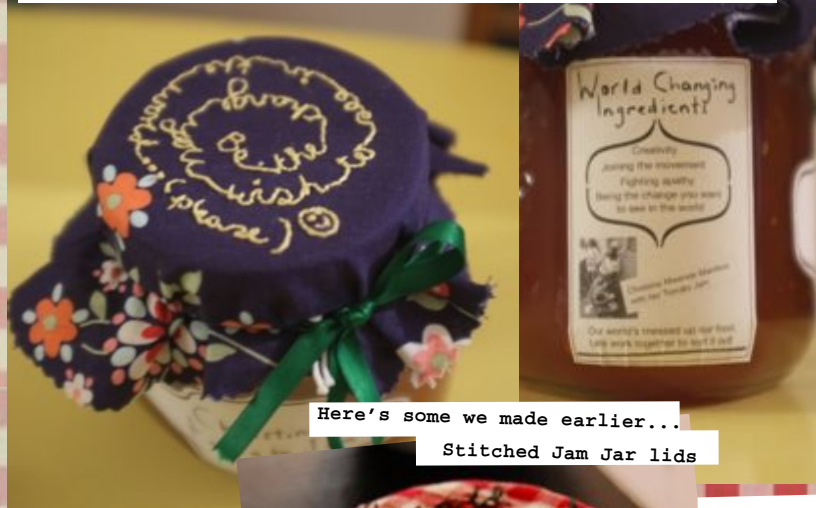
Here's some we made earlier... Stitched Jam Jar lids

Who you going to give your full jam jar to as a way of encouraging them be part of the solution to the unfair food processes in the world? How are you going to be part of the change you wish to see in the world?