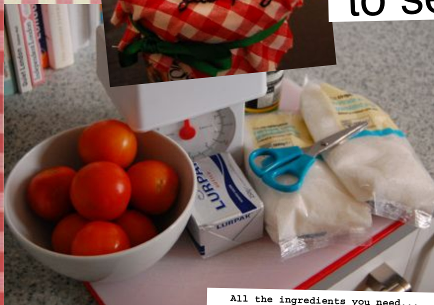
All the ingredients you need...