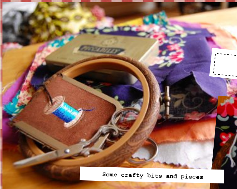
Some crafty bits and pieces